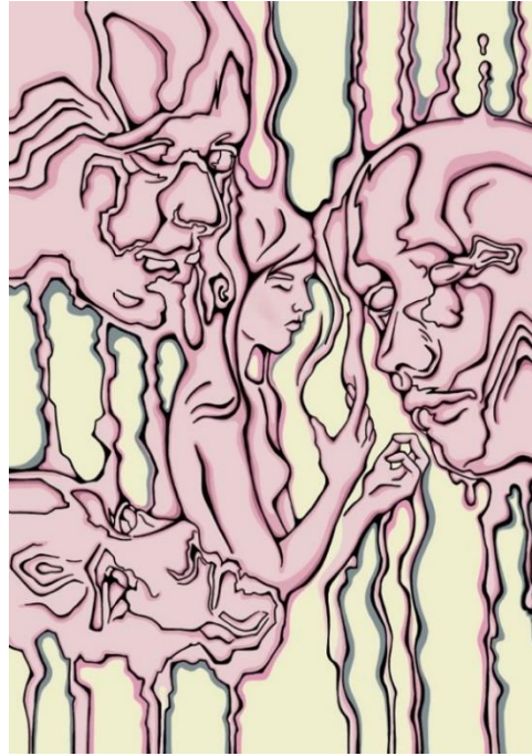
Figure 4. Drawing produced in the digital form coded as N04. The concept of “Persona” and “Shadow” archetype in Carl Jung theory.