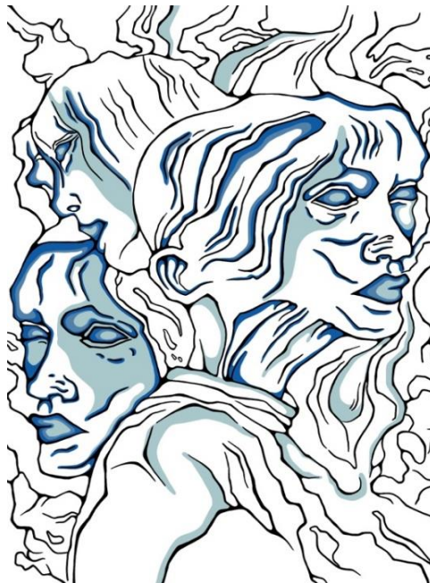
Figure 5. Drawing produced in the digital form coded as N05. The concept of “Persona” and “Shadow” archetype in Carl Jung theory.