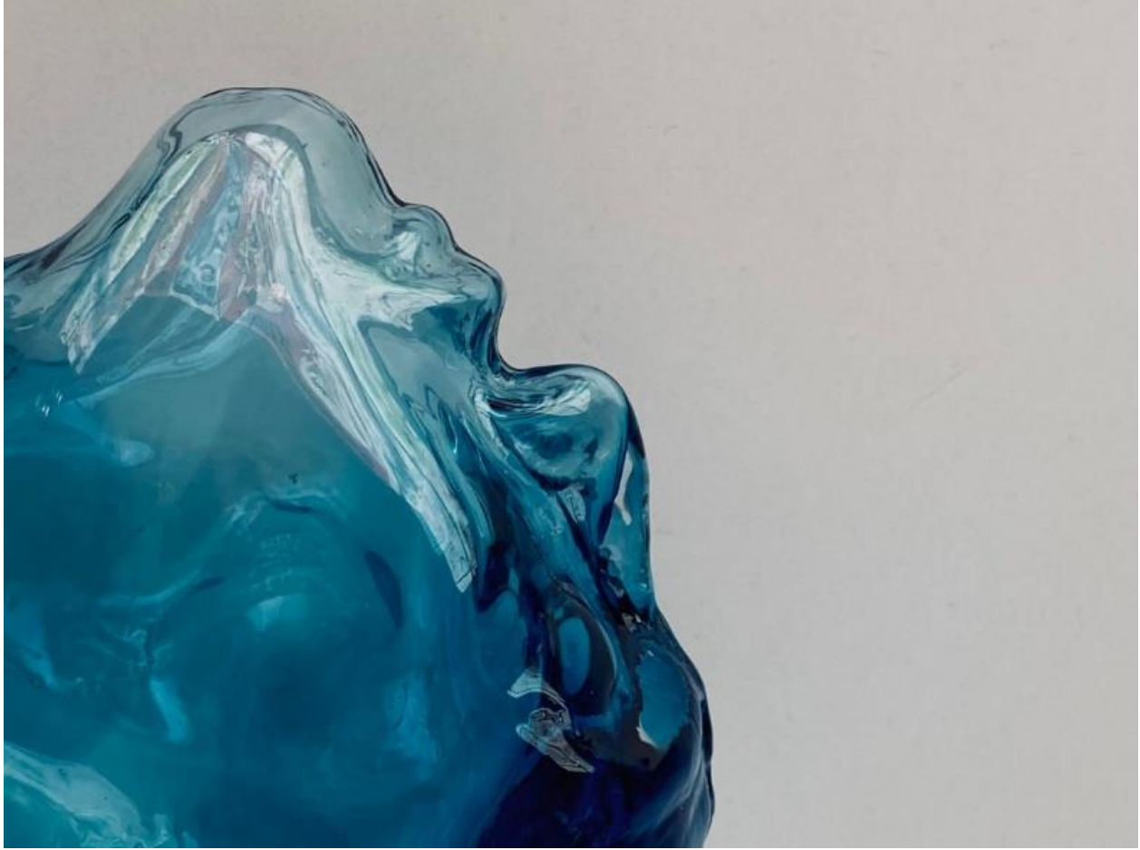
Figure 1. Glass sculpture coded as N01. The concept of “Persona” and “Shadow” archetype in Carl Jung theory. (Expressed through glass sculpture, referring to “HUMAN” being a part of the body as a part of “Persona” archetype.)

relate to art. The 6 works (sculptures and 3D digital drawings) of the researcher on Jung's persona and shadow archetypes can be seen below with their codes ( N01, N02, N03, N04, N05, N06). The visuals of the works were communicated to the experts with 6 questions, and the answers of the experts are interpreted in the conclusion section.