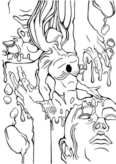
Figure 6. Drawing produced in the digital form coded as N06. The concept of "Persona" and "Shadow" archetype in Carl Jung theory.